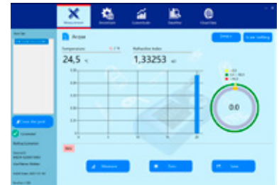
Software supplied with the DBR 95, for remote control and creation of customized scales